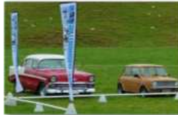
The perks of the job - presidential car parking at the open day!

If you want to go and have a look at some pictures from some of our