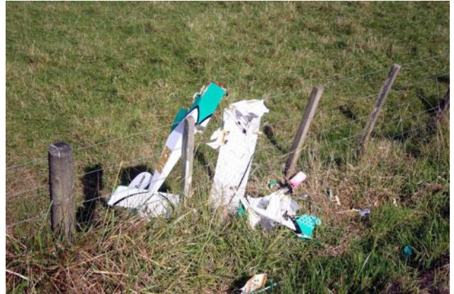
When a Stik turns into many little Sticks.