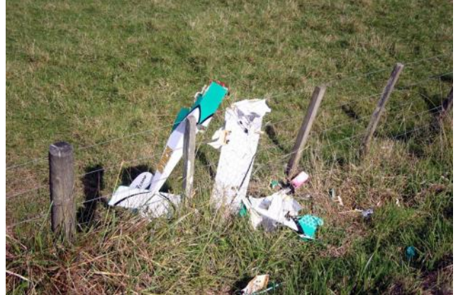
When a Stik turns into many little Sticks.