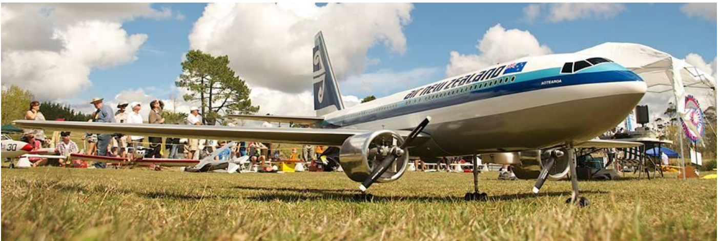
The Boeing 767, twin OS 108's and 16kg servos except the ones on the throttle which have been upgraded with traxxas water-proof car steering servos. Now it's just waiting for flight